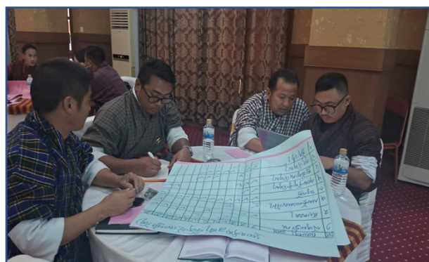
Figure 6: Hands-on training on RLI Tools.

On the second day, the training focused on introducing the Drongsep Yardrak approach, also known as Rural Livelihood Improvement (RLI). Participants were given a hands-on experience using different tools that are part of the RLI framework. These tools are meant to support local governments in better understanding and addressing the needs of rural communities. One of the major activities included training on Local Area Potential-Based Planning, which helps identify available local resources using a Resource Matrix Module. In addition, participants were taught how to use the Seasonal Calendar, which shows how activities or needs vary across different times of the year, and Community Scanning, which allows for a quick overview of the community's current situation. These tools are important because they help local leaders and functionaries work closely with the community to identify their main needs, available resources, and existing gaps. This makes it easier to involve local people in decisions that affect their lives and development in the village.