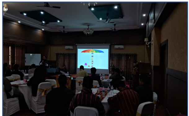
Figure 5: Presentation on forming inclusive community platforms under the "One-Umbrella CEP" model.