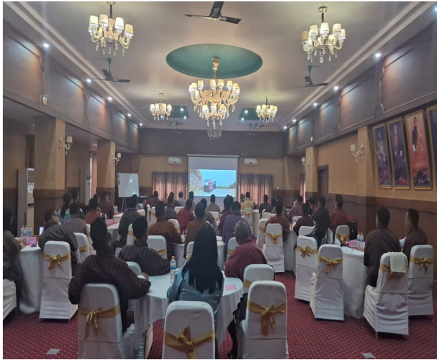
Figure 1: Screening of the Karma Lhazin video clips to understand the challenges faced during the current Chiwog Zomdu.

Each workshop was conducted over four days. On Day 1, participants were introduced to the goals and structure of the program. This included an ice-breaking session and a video analysis of challenges in community meetings (Chiwog Zomdu) using the Karma Lhazin video clip. This helped initiate discussions on the gaps in current community engagement practices. This was followed by technical sessions on the Community Participatory Model, the Ringelmann Effect, and the advantages of forming inclusive community platforms under the "One-Umbrella CEP" model. Participants also engaged in a community mapping exercise to understand representation and structure.