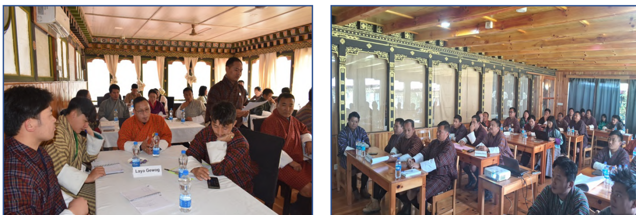
Figure 13: Presentation on Social Accountability Mechanism by Focal Person.

On the final day of the training, participants were introduced to the Social Accountability Framework, which highlights the role of community participation in promoting transparency and accountability in governance. The main focus was on helping teams of local government officials develop action plans to establish Community Engagement Platforms (CEPs) in their respective chiwogs. These plans were tailored to reflect local needs and resources while aligning with GECDP (Gender, Environment, Climate, Disaster & Poverty) principles. Participants worked in groups, received guidance from facilitators, and refined their plans through collaborative discussions. Each team presented their final plans during the wrap-up session, which encouraged shared learning and peer feedback. To support implementation, participants were provided with budget proposal guidelines, with DT Secretaries taking the lead in coordinating the proposal submission and implementation of CEP activities at the gewog level.