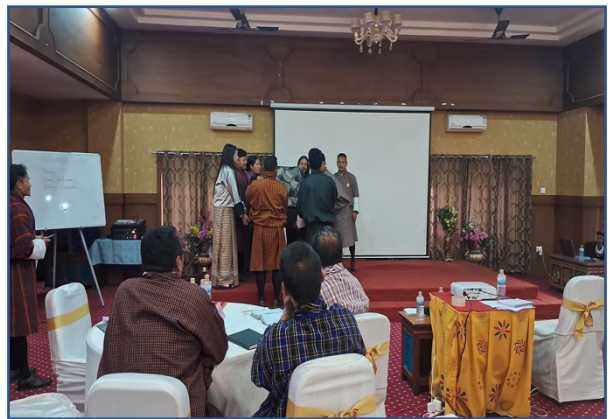
Figure 3: Exercise on the Ringelmann Effect.