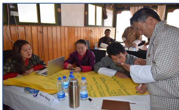
Figure 8: Local resources identification using resource matrix tool.