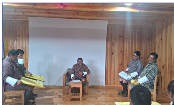
Figure 12: Chiwog mock Zomdu.