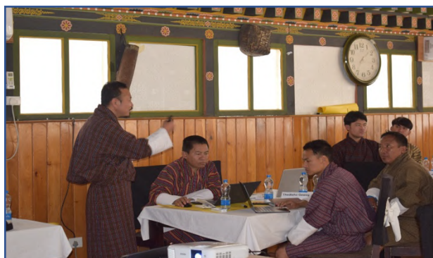
Figure 10: Experience sharing by Gakiling Gup.

On Day 3, the training began with an experience-sharing session from pilot sites that had already implemented the Community Engagement Platform (CEP). Officials from Gozhi and Khebisa Gewogs under Dagana, Gakiling Gewog under Haa, Gaytsha Chiwog under Bumthang, Kengkhar Gewog under Mongar, and Semjong Gewog under Tsirang shared their firsthand experiences. They spoke about the practical challenges they faced while introducing CEP in their communities, such as encouraging community participation, managing time, and coordinating with different stakeholders. At the same time, they also shared their successes, like improved community involvement in planning and better prioritization of local needs. These real-life examples helped participants understand the impact of CEP and gave them confidence and ideas to implement it effectively in their own gewogs.