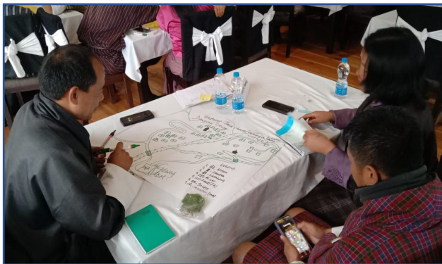
Figure 4: Group Work on the Community Mapping.