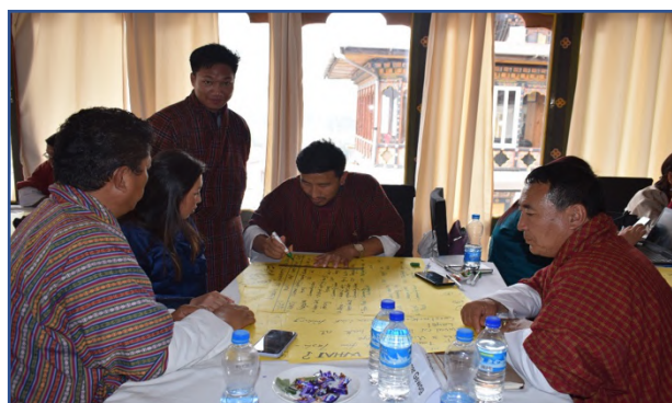
Figure 9: Group work on community scanning tool.

The training sessions were practical and interactive, with participants grouped to practice the tools in settings that resembled real villages. This hands-on method helped them understand how to apply the tools effectively in their own gewogs. The group work encouraged learning, idea sharing, and questions in a supportive environment. By the end, participants felt more confident and capable of involving communities in identifying and addressing local challenges.